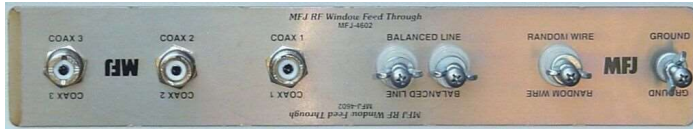
Figure 5 Window feed-through