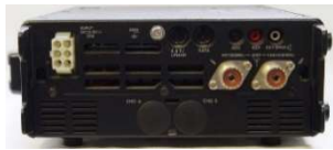
Figure 2 Rear panel of typical HF/50MHz transceiver

We hams use coax to feed the RF from the transmitter to our antennas. It’s commonly used to feed dipoles, verticals and beams. You’ve probably read about the characteristic impedance ( Z ) of various transmission lines and that it is important to know the impedance when purchasing. 50 ohms is by far the most common impedance of the coax we use. Using coax with an impedance other than this results in a mismatch between the radio, coax and the antenna. Your radio will not function properly and could be damaged. This is to be avoided. We must connect the coax directly to the output of transmitter equipped with a SO-239 connector, among the most common in the industry. See Figure 2.